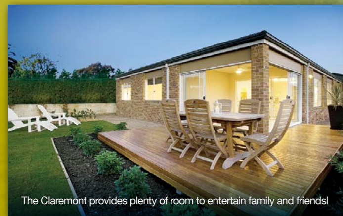
The Claremont provides plenty of room to entertain family and friends!

The Claremont combines a practical family-friendly home design with a host of standard luxury appointments. Boasting four bedrooms and two huge living areas, the Claremont is also an entertainer's delight offering a designer kitchen with European appliances and Lanai outdoor room. This home is made for entertaining and relaxing!