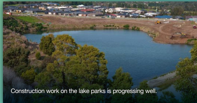
Construction work on the lake parks is progressing well.

The lakes works were not the only works taking place at Cardinia Lakes this winter. Construction of new homesites in stages 6B (Eliza Heights) and 7C (Parkside) progressed well and work also commenced in Stage 9 (Pinnacle).