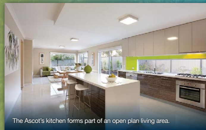
The Ascot's kitchen forms part of an open plan living area.

Compact and creative is the best way to describe the Ascot. Well suited to narrower lots, this home design features three bedrooms plus a study. The user-friendly kitchen is supported by two comfortable living zones that have outlooks to the side and rear. With many luxury features as standard, the Ascot represents good design and value.