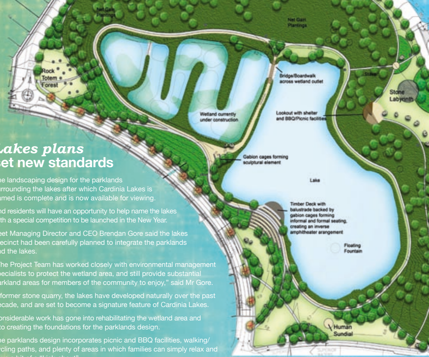
Proposed landscaping plan for eastern lake precinct due for completion 2010.

The Sales Office, located on the corner of Huron Parkway and Bonneville Parade, is now directly accessible off Bonneville Parade. Opening hours are from Saturday to Wednesday, 12 – 5pm.