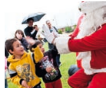
A night less ordinary Christmas celebrations, Thursday 3 December