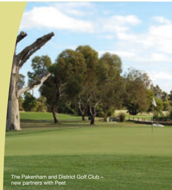
The Pakenham and District Golf Club – new partners with Peet

If you'd like to know more about the Pakenham and District Golf Club, visit the new website at: www.pakenhamgolfclub.com